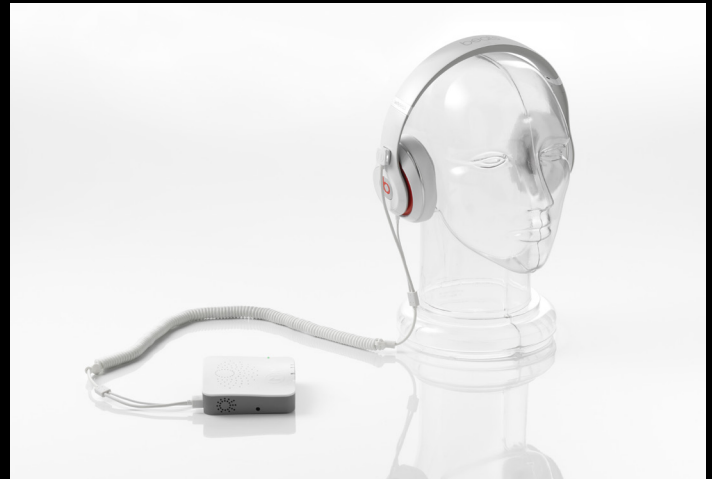
Mini-disc Sensor w/Audio